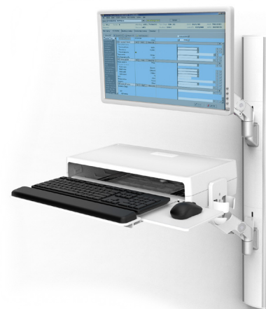
V6 Wall Workstation

Contact Capsa Healthcare for solutions to manage medications, supplies, and EHR/EMR.