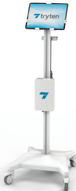
Tryten S1 Tablet Cart