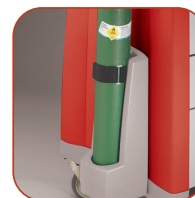
Oxygen Tank Holder