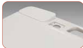
Blank Cover Plates