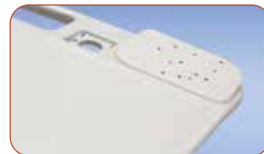
Scanner Mount Plate