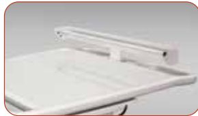
Laptop Security Bar