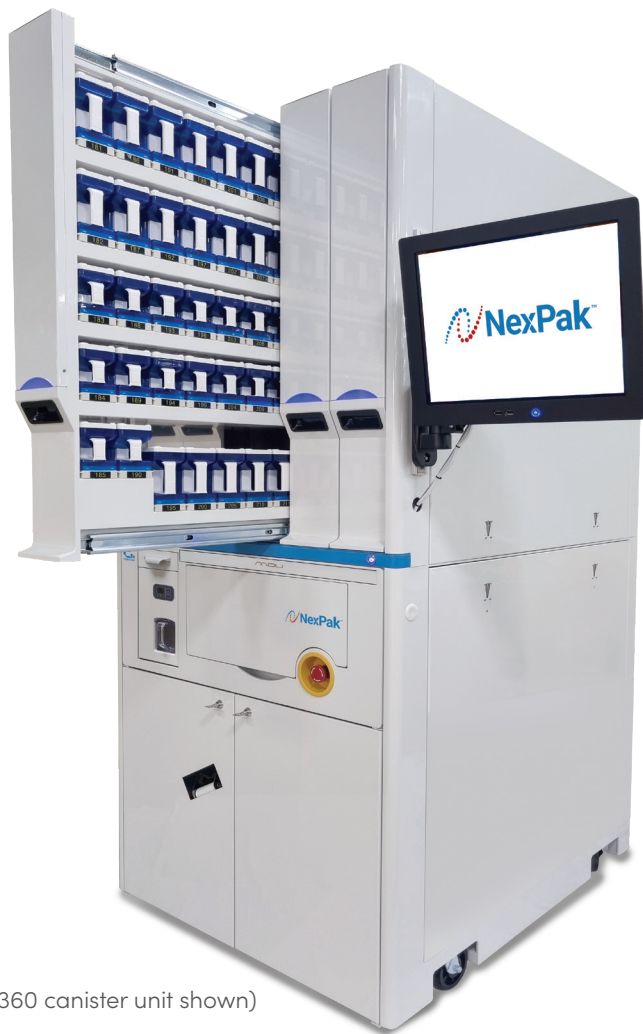
(360 canister unit shown)

Automated Medication Packaging For Multiple Care Settings & Elevated Patient Outcomes