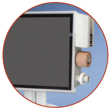
Access Pack for med cups, tape and alcohol wipes and/or scanner holder