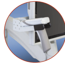
Forked Scanner Holder