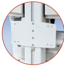
Infection Control Wipes Bracket