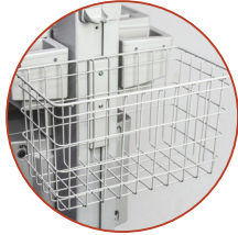
Wire Basket (standard or extra large)