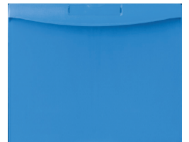
Pharmacy Robot Envelope Drawer