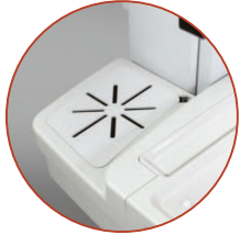
Barcode Scanner Shelves and Scanner Holder Options