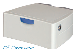
6" Drawer Electronic lock or non-locking