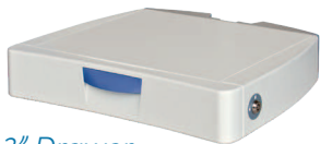
3" Drawer Electronic lock or non-locking

Flexibility to configure workstation with storage drawers in 3" or 6" depths