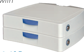
2-3" Drawers Electronic lock or non-locking